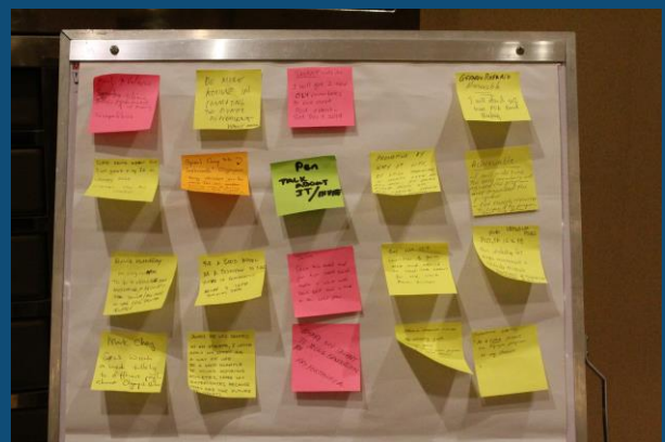
Commitments made by workshop participants