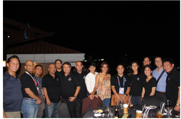
OLY Party at the Bay Leaf Hotel rooftop, post workshop